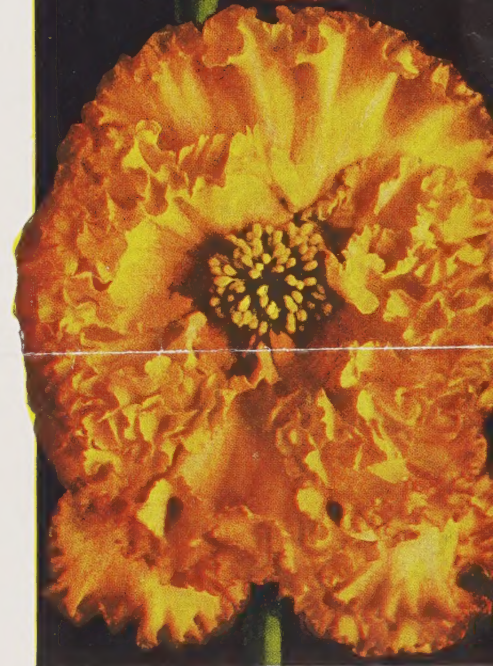
BEGONIAS: Camellia (above), Crispa (below)